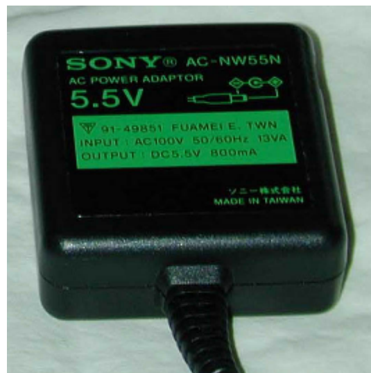
Figure 1– Example of Ac-Dc Power Supply Nameplate Output Voltage and Current

Additional load conditions may be selected at the technician’s discretion, as described in IEEE 1515-2000, but are not required by this test procedure.